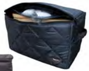
Dry ice pocket under lid